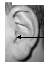
Tragus (Fig 3)

ALERT: Call your child's doctor, nurse, or clinic if you have any questions or concerns or if your child has special health care needs that were not covered by this information.