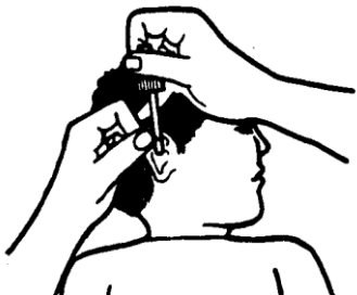
Older child (Fig 2)